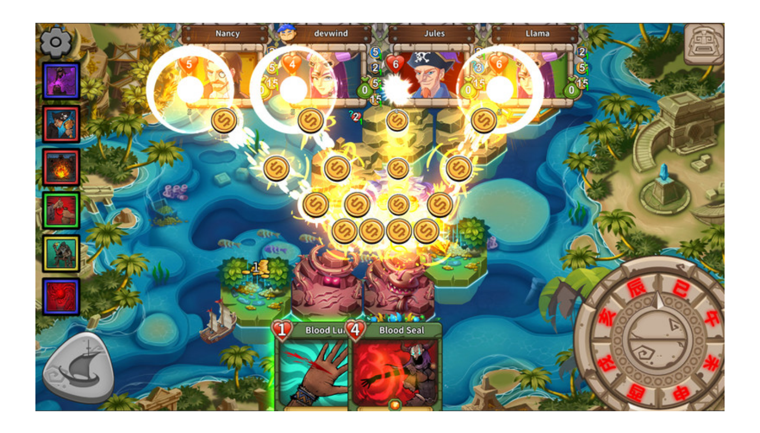
Just A Cleric OST Activation Code [torrent Full]

Download >>> <a href="http://bit.ly/2NIEGRU">http://bit.ly/2NIEGRU</a>